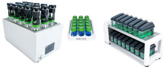
Gas Endeavour® - standard configuration from BPC Instruments

Gas Endeavour® is designed to accurately and precisely measure low gas volume and flow for any type of gas production or consumption from biological respiration or fermentation processes. Gas Endeavour® saves time and labor in performing analysis by working fully integrated and automatic, leading to efficient research and profitable production. According to the assessment of the Company it is the perfect analytical instrument for research and industrial applications, including the biodegradability evaluation of various plastics and packaging materials. Furthermore, it's suitable for in-vitro digestibility assays for animal nutrition, bacteria activities and pollution analyses for wastewater treatment, process optimization for 2 nd generation ethanol and biohydrogen production, greenhouse gas emission assays, evaluating activities of microbial communities in various environmental conditions and so on.