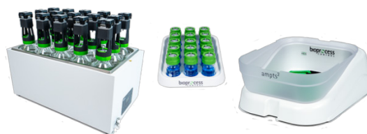
AMPTS® II from BPC Instruments

The Automatic Methane Potential Test System (AMPTS®) is a research-standard analytical tool for anaerobic batch fermentation testing which is a well-recognized methodology for various types of bioanalyses associated with anaerobic microorganisms. The product can house 15 glass reactors for multiple sample analyses, including biochemical methane potential tests, anaerobic biodegradability studies, specific methanogenic activity assays, and residual gas potential analysis on digested slurry. All of these are performed with easy access to sampling, analysis, recording, and report generation; fully integrated and automated. AMPTS® lets users determine the optimal retention time and mix of substrates for co-digestion, screen proper pre-treatment methods, and evaluate the need for additives, which are critical information for the cost-efficient operation of a biogas plant.