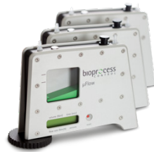
µFlow from BPC Instruments

BPC® µFlow is a compact standalone volumetric gas flow meter for reliable, accurate, and precise measurements mainly used by scientists from universities/institutes or engineers from industry. By offering a large detection range with high linearity, it is the perfect flow meter for online, real-time monitoring of any type of gas and gas mixture at a laboratory scale for biological, microbiological, chemical and physical gas emission or consumption processes.