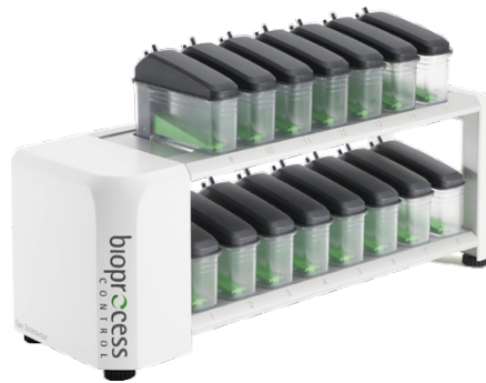
Gas Endeavour® Core from BPC Instruments

BPC Instruments continuously strives to develop and enhance its products to be ahead of its competitors. Within the near future, BPC Instruments will launch its new product BPC® Go containing an in-built computer to simplify and secure low gas volume and flow measurements of both wet and dry gasses, which will be the perfect instrument for the real-time monitoring of gas from any location. A new generation of the product portfolio will also be launched soon afterwards to ensure the Company's top market position is maintained in both the biogas and new business sectors.